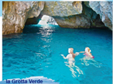
la Grotta Verde SWIM IN THE CAVE

CAPRI SANDALS Ragazzino Shoes Piazzetta Ignazio Cerio, 9 Ph + 39 081 837 44 59 - Mob. +39 339 31 91 266 www.sandalicapresi.com - riccioperin@alice.it