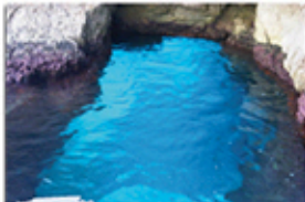
Piccola Grotta Azzurra