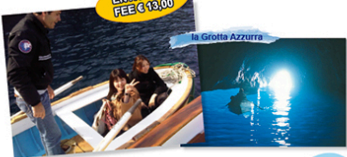
la Grotta Azzurra