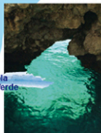
Piccola Grotta Verde